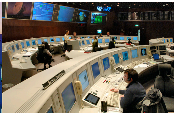
ESA technology transfer - the space you need to get your business off the ground